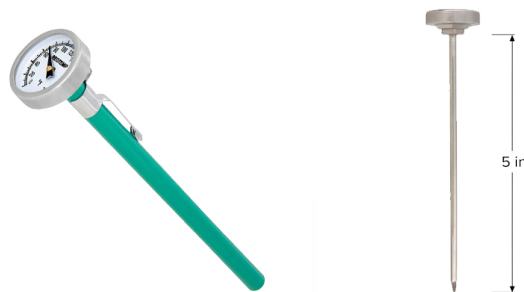
K-79 Analog Dial Model