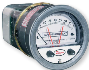
Series 43000 Capsu-Photohelic® switch/gage

Set points are instantly adjusted with front knobs.