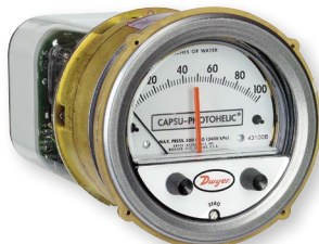
Series 43000 Capsu-Photohelic® switch/gage with brass body