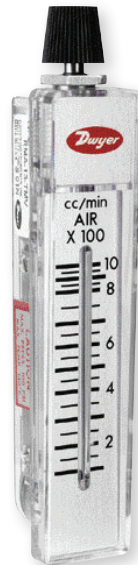
Model RMA-TMV 2" scale, 4-13/16" high