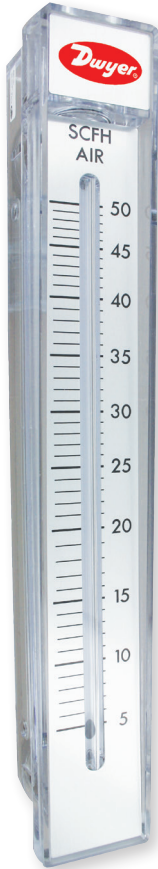
Model RMC 10" scale, 15-3/8" high

2", 5" or 10" Scale, Interchangeable Bodies