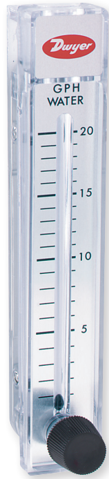
Model RMB-SSV 5" scale, 8-3/4" high